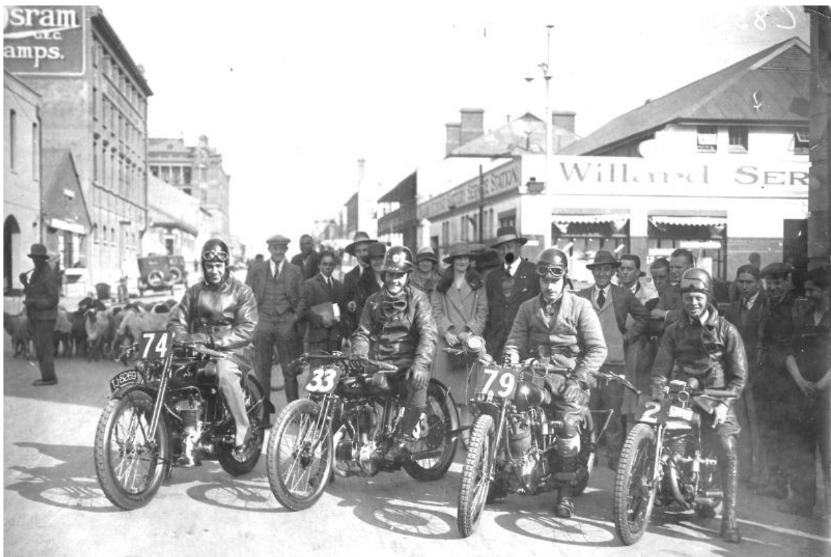
A group of riders before the start of the 1927 DJ event.